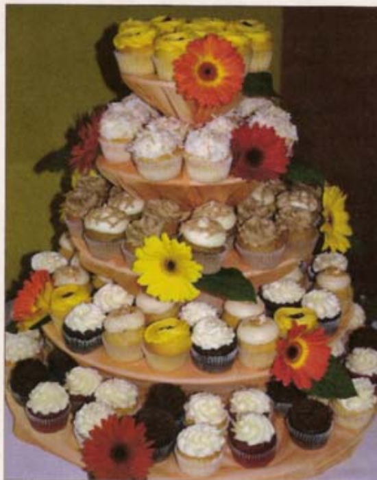
Cupcakes form a unique "cake" that is easy to serve.