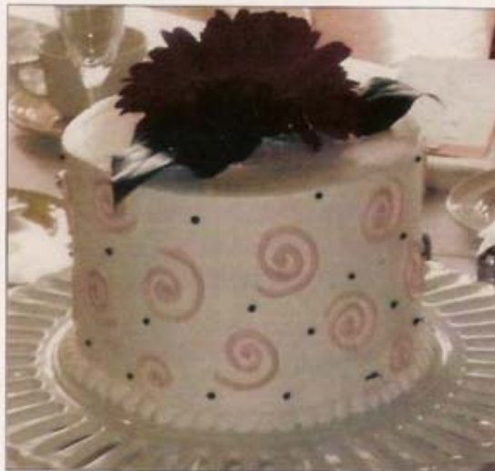
Individual cakes serve as centerpieces and as dessert.